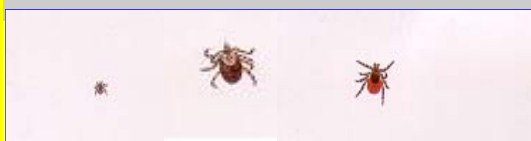
Actual sizes of nymph (left), adult female dog tick (center) and adult female deer tick (right)